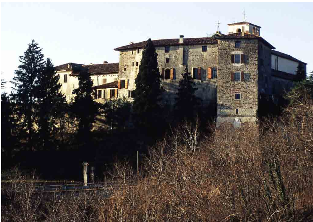
Fig. (2). –Rosazzo Abbey (North East of Italy)

The ambitious intention of the Society is to aggregate all endocrinologists dealing every day with clinical issues.